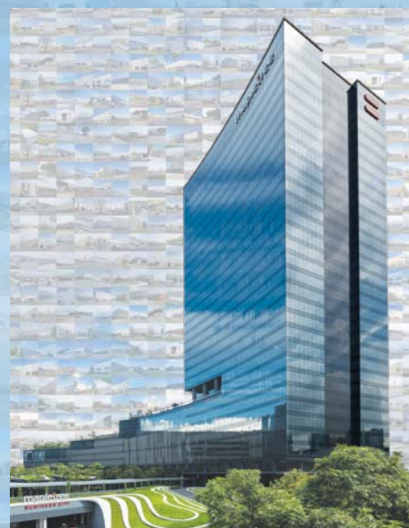
Mapletree Business City II (MBC II), Singapore

Mapletree's Annual Report 2018/2019 theme details the Group's growth into new markets which identify new opportunities.